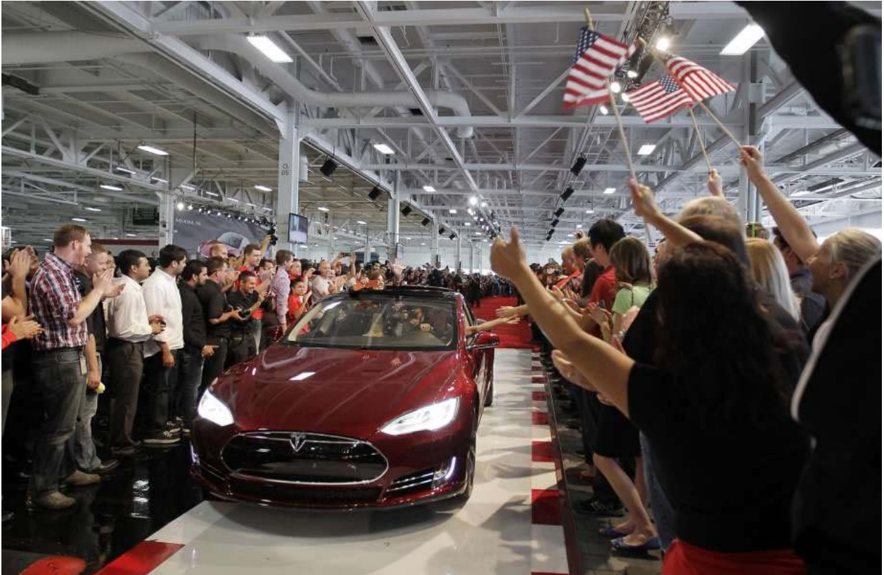
In this June 22, 2012 file photo, Tesla workers cheer on the first Tesla Model S cars sold during a rally at the Tesla factory in Fremont.

Without attracting much notice, Tesla Motors has become one of Silicon Valley's biggest property holders, its collection of facilities not far behind the sprawling campuses of Apple and Google.